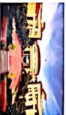
Oakridge International School