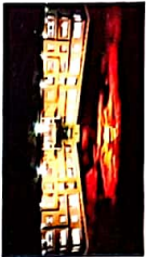
Miracle Software Park (GUM City)