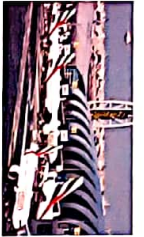
Greenfield International Airport