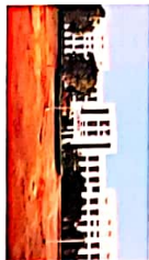
ANITS Medical College